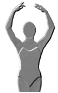
Arms in Ballet High Fifth Position