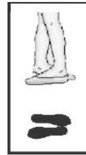
Feet in Ballet Fifth Position