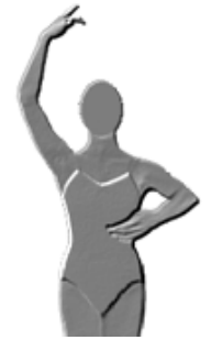
Arms in Ballet Fourth Position