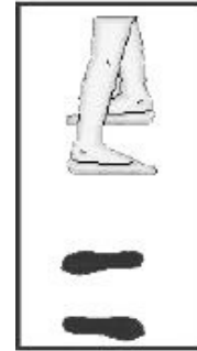
Feet in Ballet Fourth Position