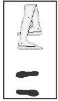
Feet in Ballet Fourth Position