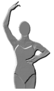
Arms in Ballet Fourth Position