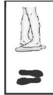
Feet in Ballet Fifth Position